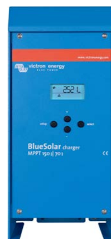
150/70 & 150/85 CAN-bus